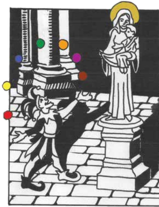
Our Lady's Juggler , a matted picture suitable for hanging (8½" x 11" with matte), is our gift to benefactors donating $49.90 or more.