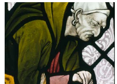
The Second Childishness

From William Shakespeare's "As You Like It," this famous passage meditates on the shifting stages of life, as proceeding from infancy, to the schoolchild, to the adolescent, to the youth, to the middle-aged, to the aged, and finally to dotage and dusty death. In these are captured the characters of age—the stages of life on the stage of the world, which stages come and go with entrances and exits in a vast, sweeping spectacle of temporal and eternal moment.