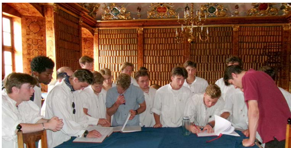
The pilgrims from Gregory the Great Academy sign the guest book in the library of the ancient Monastery of Jasna Góra in Częstochowa, where the famous icon is enshrined. As they sign, they look back through the pages to find the names of their old classmates, gaining a sense of their place in the pilgrim tradition of their school.

Perhaps it was the manner in which our joy was manifested after a day balanced by solemnity, reverence, joy, and laughter. Between our music, juggling, and spirit of adventure,